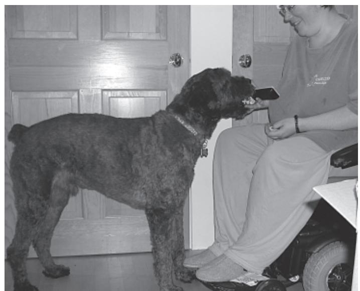
Gadget, a Bouvier service dog, demos an innovative way to enable a dog to differentiate between similar looking objects or find a lost object if told to retrieve an item. For details on how Gadget learned this scent retrieval skill, see article on page 12.